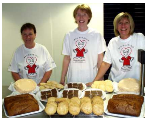
Staff from Sullivan Upper School in Holywood, Northern Ireland, organised a craft and coffee morning