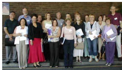
CMA members attending the Key Contacts training day

We organise five regional information days annually in the UK. This allows people living with cardiomyopathy the opportunity to hear concise presentations on the development, care and treatment of cardiomyopathy from internationally renowned specialists. Delegates have the opportunity to ask questions and discuss their concerns. The meetings have the additional benefit of providing an often unique opportunity for people to meet other people and families affected by the condition.